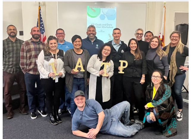
Irvine USD Staff

Program Specialist and ISE NIC Member, Coachella Valley USD